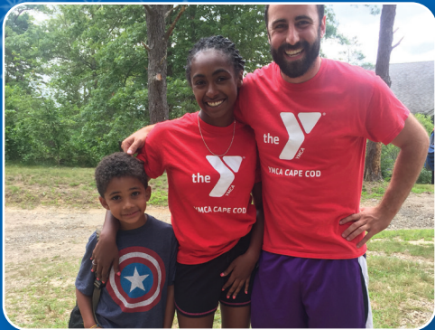
School Age Before & Afterschool Programs, Summer Day Camp