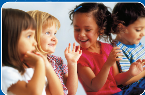
High Quality affordable Child Care at the North Falmouth Congregational Church & Falmouth Hospital