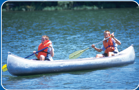
Traditional Summer Camp Experiences at Camp Lyndon on Lawrence Pond in Sandwich