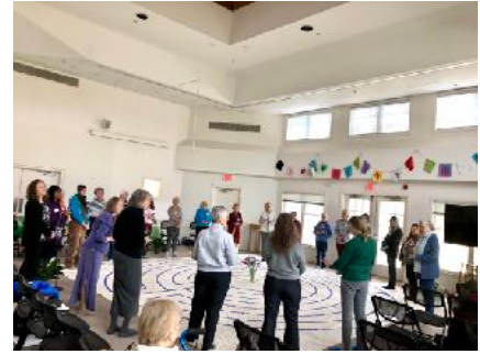
International Women's Day Celebration, March 9, drew an enthusiastic crowd!