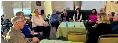
Justice Documentary series began March 1 with the film “POWER.”