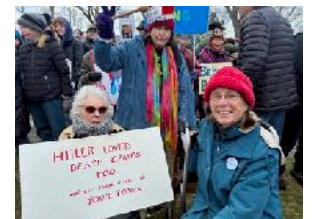
“No Kings” rally March 28 on the Falmouth Green. Our new banner was put to good use! LOTS of people from UU Falmouth came to have their voices heard!