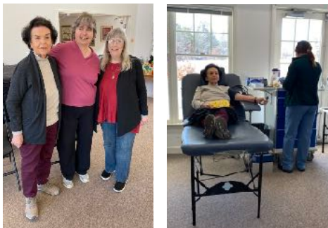
UU Falmouth sponsored a Blood Drive at the Meeting House on March 9. Over 24 people donated blood. Thank you to those who organized, gave blood, and baked brownies!