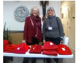
“Melt the Ice” protest hats sold after Sunday services to benefit MA Immigrant & Refugee Advocacy Coalition.