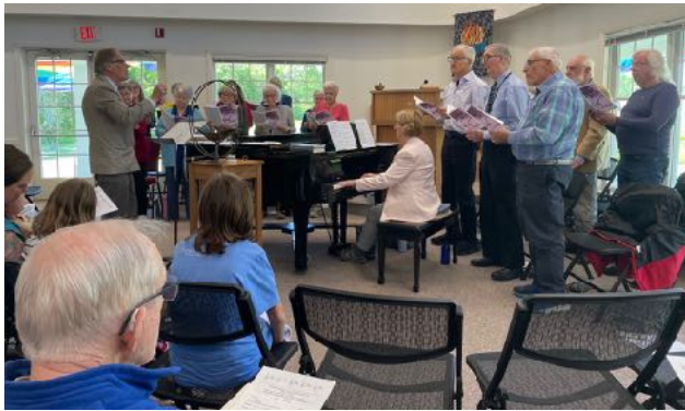
Hymn Sing Sunday, June 1 was enjoyed by all.