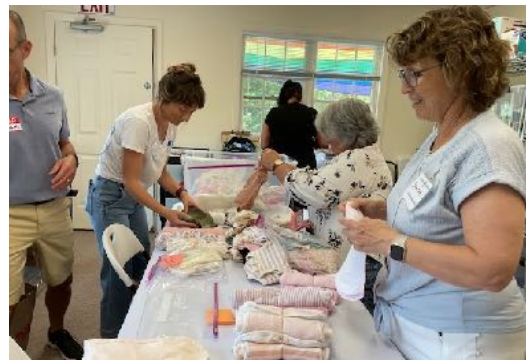
Cape Cod Foster Closet is up and running at the Meeting House every Thursday from 9:30-12.