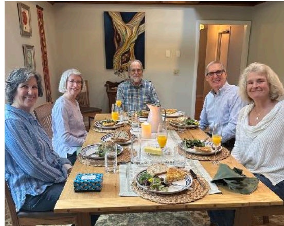
Another wonderful "Dinner for Six" which takes place on the 4th Saturday of the month.