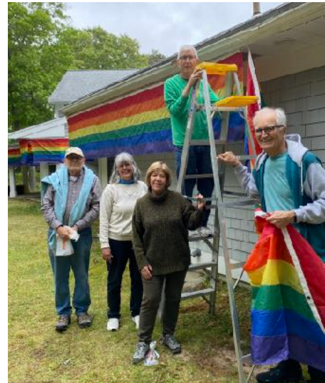
Surrounding the Meeting House with Pride for the month of June.