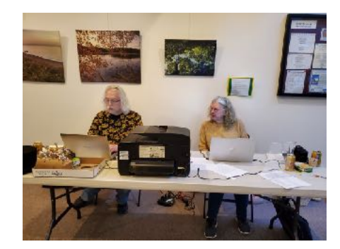
Thank you to all those who worked so hard to make the Auction and Potluck on April 13 such a success (and so much fun!).