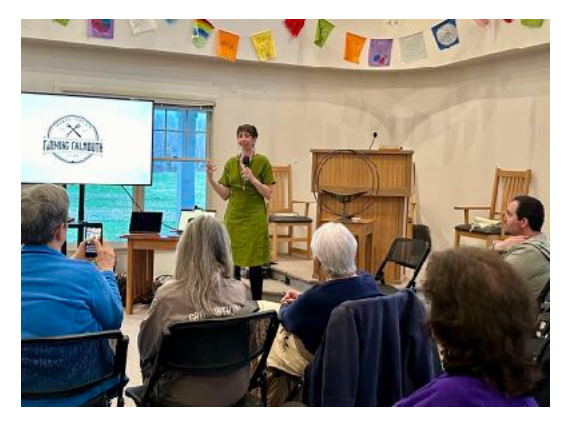
Farming Falmouth presented a lot of valuable information at their April 17 event.