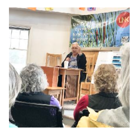
On April 20, over 100 people attended the fourth event in a year-long collaboration between UU Falmouth and L.I.N.K (Linking Indigenous & Non-Indigenous Knowledge).